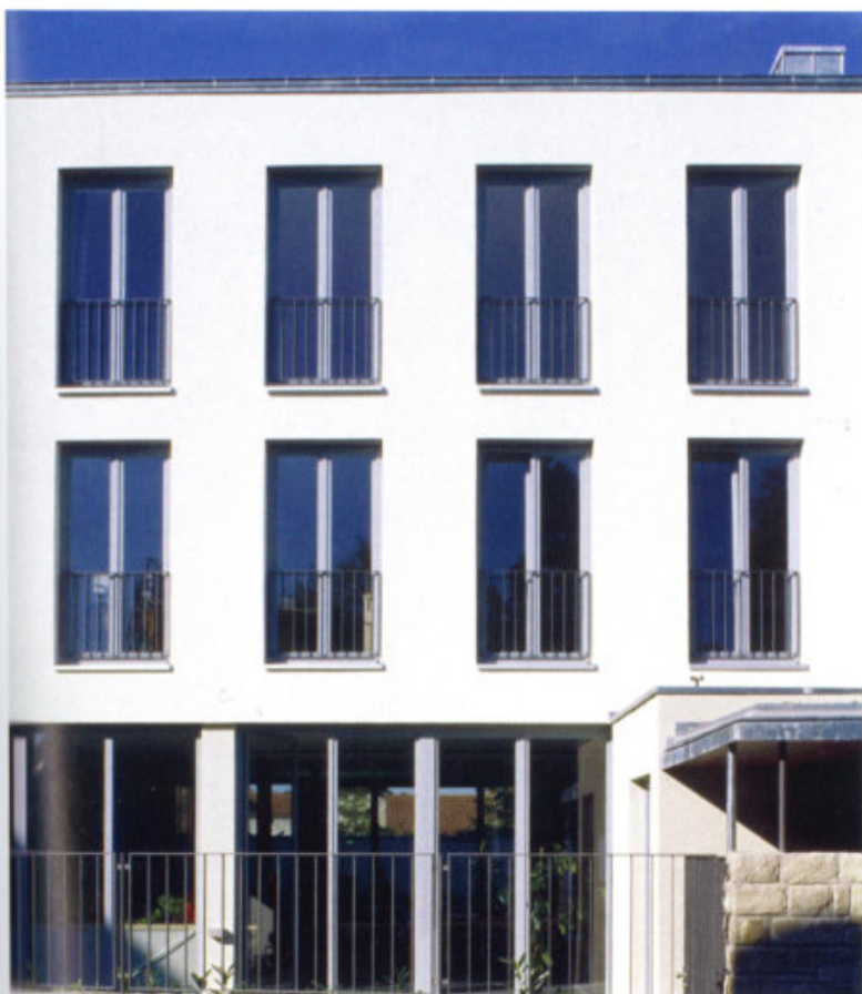
↑ | Façade ↓ | Exterior view from the street

Address: Spitalstraße 23, 97332 Volkach, Germany. Client: Klaus und Dorothea Hart. Completion: 2005. Building type: living and commercial house. Gross floor area: 450 m 2 . Original building: architect unknown. Client: Sparkasse Volkach. Completion: 1972. Building type: bank building. Gross floor area: 300 m 2 .