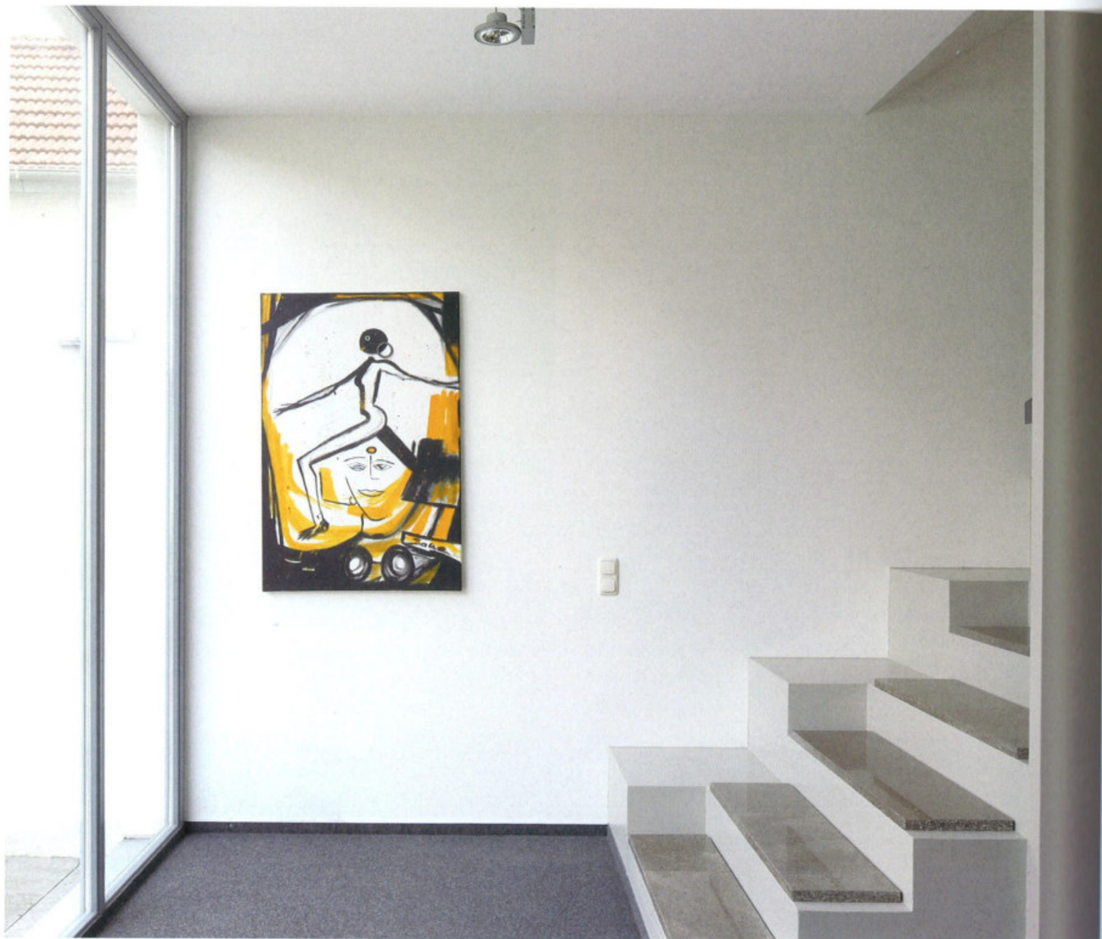
↑ | Interior, staircase ↓ | Original building